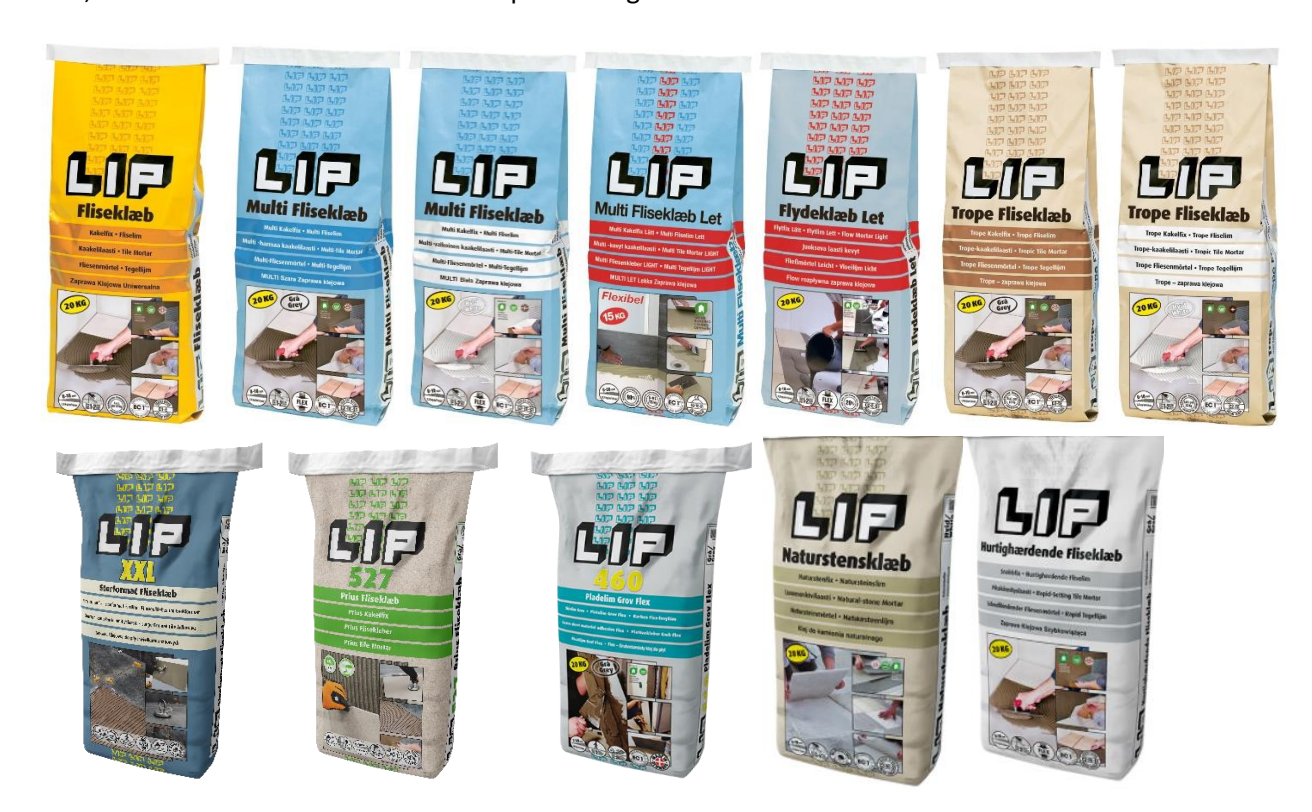
Figure 1: Pictures of the LIP products covered in this project report.

LIP Tile Mortar, LIP Multi Tile Mortar – Grey and White, LIP Multi Tile Mortar Light, LIP Flow Mortar Light, LIP Tropic Tile Mortar – Grey and White, LIP Tile Mortar XXL, LIP 527 Tile Mortar, LIP 460 Sheet adhesive coarse flex, LIP Natural Stone Grout and LIP Rapid-Setting Tile Adhesive.